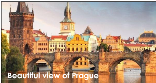
Beautiful view of Prague