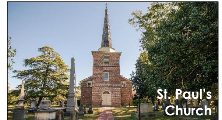
St. Paul's Church

After checking out, our tour continues with a visit to the oldest active courthouse in North Carolina, the 1767 Chowan County Courthouse , followed by a tour of St. Paul's Church , the 2 nd oldest church in North Carolina & its historic graveyard, established in 1722 and the final resting place of three colonial governors. Lunch will be at St. Paul's Parish Hall before we return to Southern Pines.